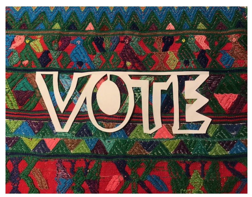
Steps to take post-election

Action items post-election, join our Climate Justice Team, save the date for Giving Tuesday, and more.