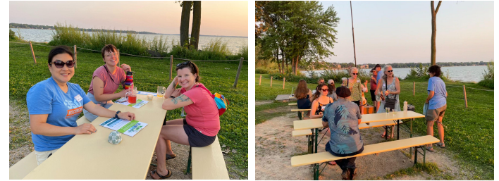
“Let’s Get Together” at Olbrich Biergarten