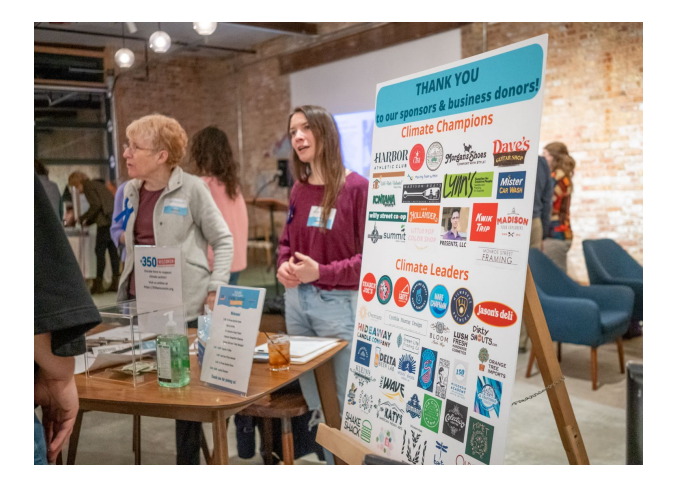
Giving Tuesday Celebration at Garver Feed Mill