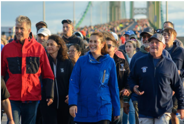
Michigan Gov. Gretchen Whitmer leads the annual Labor Day Mackinac Bridge Walk on Sept. 6, 2021

So, we joined Climate Safe Pensions on March 28 with the petitions in hand to remind SWIB of their fiduciary responsibility to assess and act on climate-related financial risks!