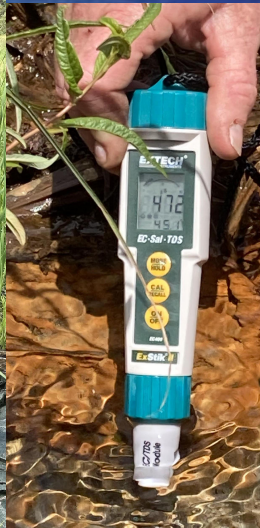
Test Meter Deep Groundwater Temperatures