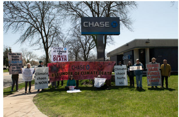
Left: Activists on the floor in the bank with signs, reading poems and prayers. Right: Holding signs on a beautiful day.