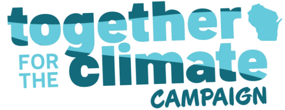
Together for the Climate: A Vision For Our Future