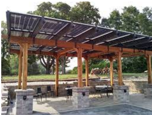
Couillard Solar Foundation Solar Pavilion