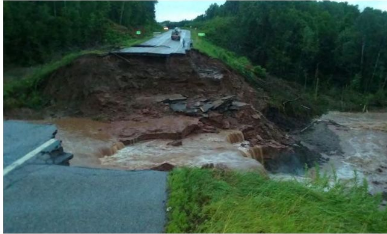
Ashland County, July 2016

The planned route of Enbridge's Line 5 reroute is disastrous. Here's why.